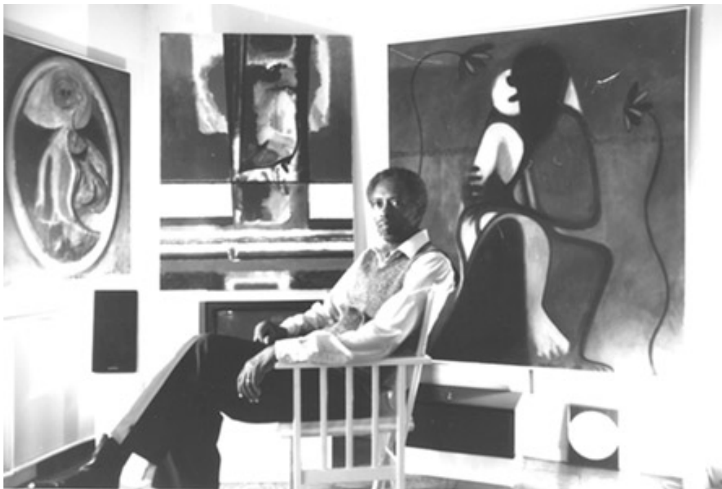
the artist in his studio, Washington, DC, 1988